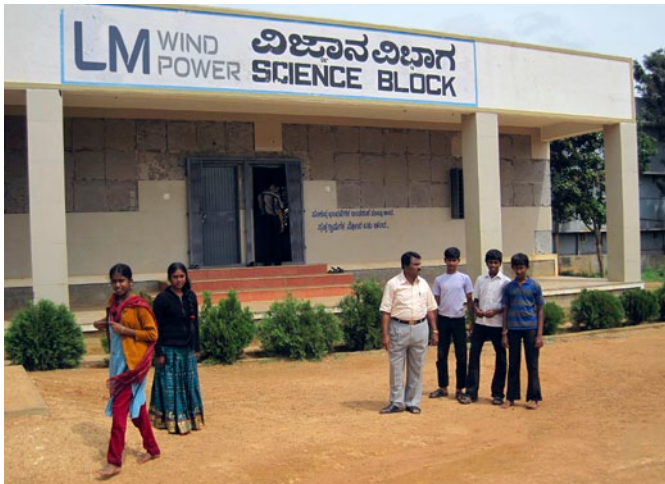
LM Wind Power helped build the new science block at Doddahullur Government High School in Hosakote, India.

DODDAHULLUR HIGH SCHOOL - IN A CLASS OF ITS OWN